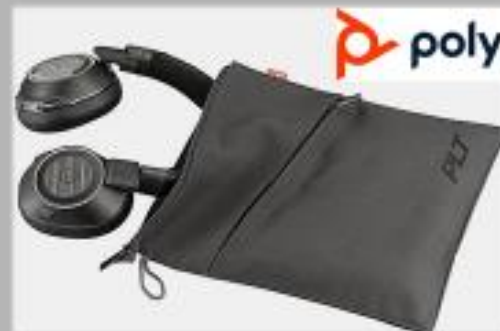
Poly Voyager 8200 UC Headset

Attendees will be entered into a random drawing to win: